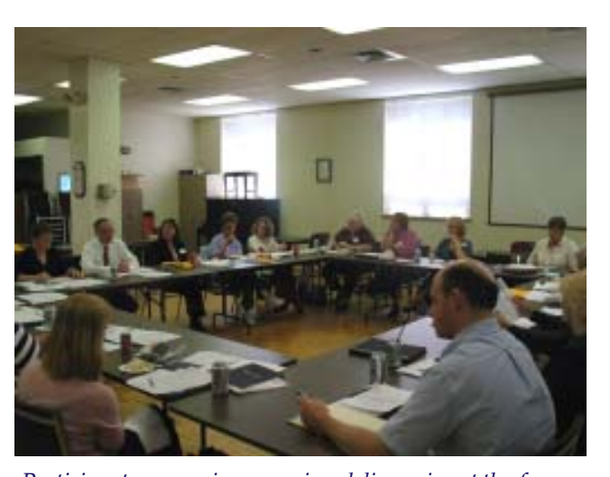
Participants engage in empassioned discussion at the fourms in Cumberland.