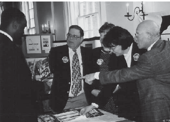
Pictured above are members of the rural health community speaking to an urban legislator on Stand Up for Rural Maryland Day, March 1999.