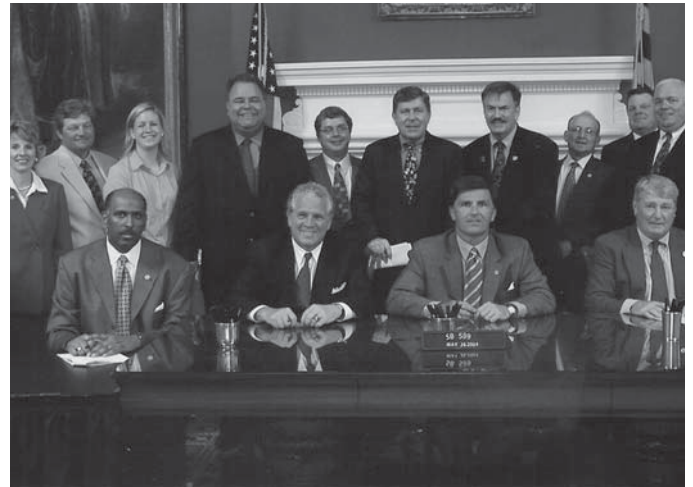
Pictured above (standing) are several rural legislators with representatives from the Rural Maryland Council, the Maryland Department of Agriculture, and the Maryland Farm Bureau, during a bill signing ceremony for Senate Bill 589 which authorized the establishment of MARBIDCO, May 2004.

The Council has also provided support over the years to the State and county agricultural marketing specialists, and has worked with Maryland Cooperative Extension, MDA, DNR, DBED, USDA and others to improve service-delivery programs and regulatory schemes to enable farmers and producers to engage in value-added processing activities to increase opportunities for profitability. In addition, the RMC has collaborated with the Maryland Energy Administration and others to bring renewable energy technologies to farmers at affordable costs.