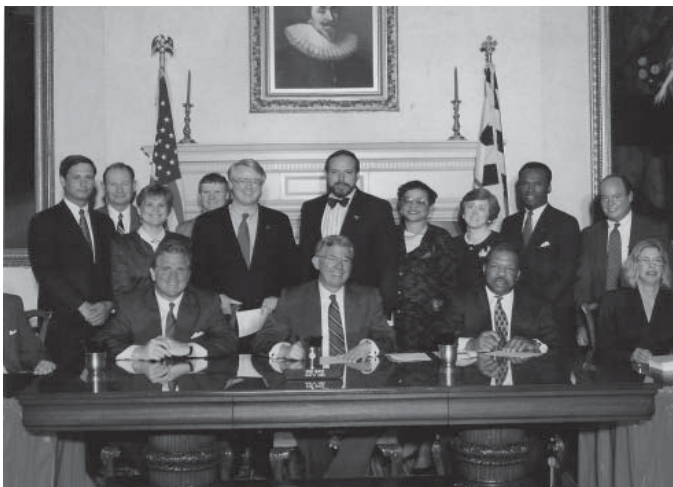
Pictured above are legislators and founding board members at a bill signing ceremony for legislation establishing the FORVM for Rural Maryland, May 1995.