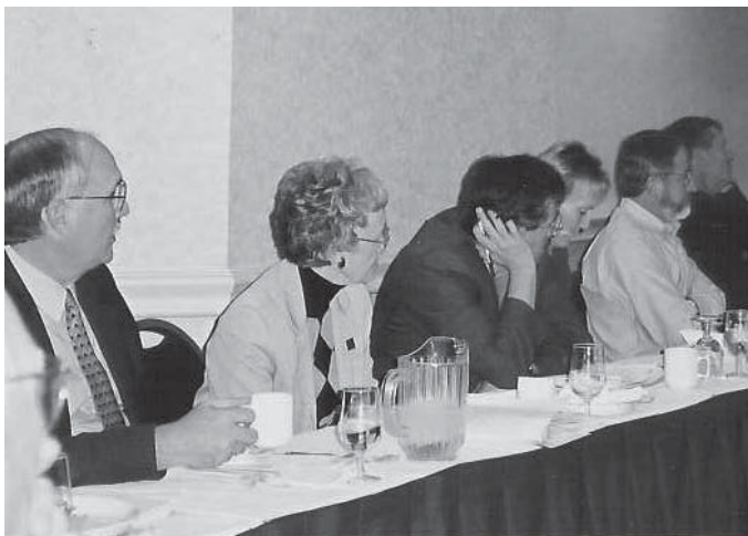
Pictured left are members of the Council's Executive Board listening to a presentation being made during a day-long strategic planning retreat held in Annapolis, October 2002.